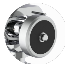
TPE Damped Counterweight